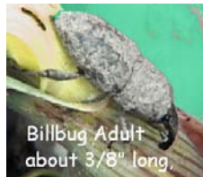
Closeup of Billbug Adult