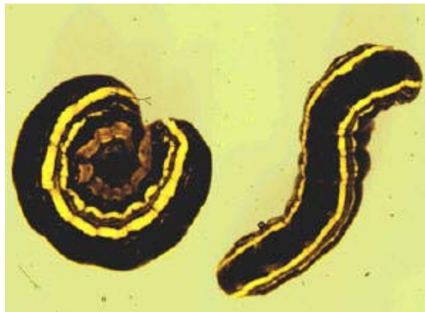
Yellow Striped Armyworm

6. Mustang -lists "yellow striped armyworm at 1.9 to 4.3 oz. Of product/acre ( 0.022 to 0.05 lb. a.i./acre with a 14 day phi for grain and 45 day phi for forage.