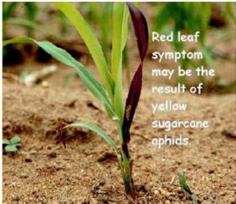
Red leaf symptom may be the result of yellow sugarcane aphids.

When you see strikingly reddish colored leaves (color may vary from red to purple) on scattered plants, examine the undersurface for presence of yellow colored aphids (slightly smaller and distinctly more yellow colored than Greenbugs). This usually turns out to be damage by a colony of yellow sugarcane aphids. Often the aphids have disappeared by the time the damage is noticed. Plants usually recover without