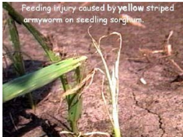
Feeding injury caused by yellow striped armyworm on seedling sorghum.

segment following the third pair of legs). It is typical to begin to see signs of foliar injury on small sorghum plants, determine that the injury is associated with yellow striped armyworms. Infestations in the range of 0.5 to 1.0 small larva per plant look to be potentially serious on growth stage 1 sorghum plants (collar of the third leaf visible). However field experience suggests that survivorship of the larvae on sorghums of this size is often poor, and frequently, no action is needed other than follow-up inspections. There have been observations where infestations averaged more than 1.0 per plant (on small plants prior to growth stage 1) that resulted in significant stand reduction in spots in infested fields. Sometimes, the risk of damage tends to be higher in weed infested fields, or where weeds were present just prior to planting.