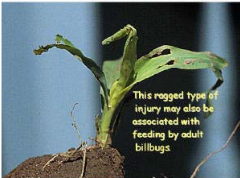
Injury may be associated with feeding by adult billbugs.