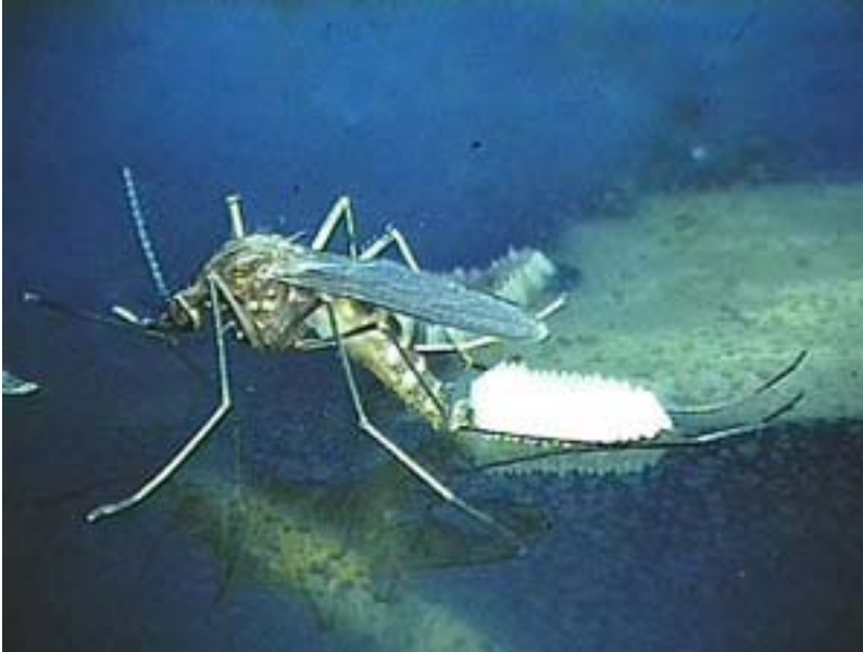
Female mosquito ( Culex pipiens ) laying eggs.