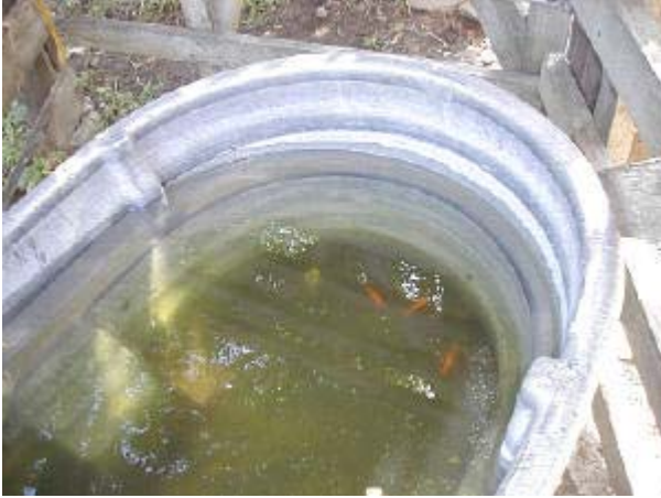
Animal drinking tank with fish.