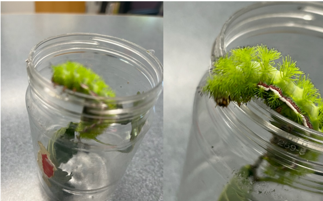
Figure 1. The photo on the right had enough focus to allow the caterpillar to be identified.

Simply put, focus is the most important thing to get right when photographing anything. Often time with insects, if you cannot really see the subject, you won't be able to get a good identification. Take the caterpillar photos below (Figure 1). The first image submitted on the left was not focused well enough to say for sure what species of caterpillar it was. A second attempt, on the right, while not perfect, had enough focus to allow it to be identified as an Io Moth caterpillar, one that can sting!