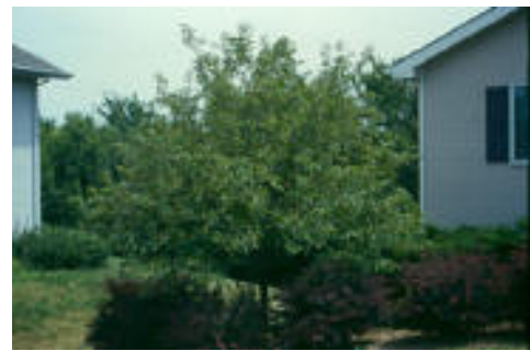
Figure 9 Fully-leaved tree

Extension publication MF-2395, Web Producing Caterpillars in Kansas provides a complete description of the insect's seasonal life history. Copies of the publication are electronically accessible, or, hard copies are available through local County Extension Offices.