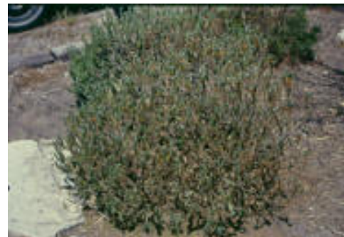
Figure 2 Severe feeding

Extension publication MF-2545, European Pine Sawfly provides a complete description of the insect's seasonal life history and its effect on the various hosts (pine species) in Kansas. Copies of the publication are electronically accessible, or, hard copies available through local County Extension Offices.