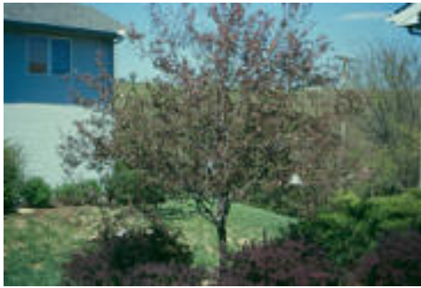
Figure 8 Visible web masses

Thus for the remainder of the season, trees present a full appearance (Figure 9).