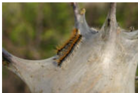
Figure 4 Caterpillar

The following images (on wild plum) illustrate the habits of eastern tent caterpillars. Web masses are formed in the crotch/fork of a branch or encircle the branch (Figure 5) ----- but never at the end of branches (as is the situation later in the season with fall webworm). On small shrubs, tent caterpillar larvae completely consume all foliage (Figure 6) forcing them to extend their feeding forays to adjacent plants. However, they always return to their tent sanctuary on the original host (Figure 7).