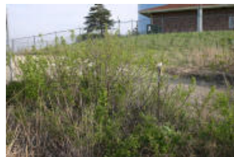
Figure 7 Additional foliage on adjacent shrubs

The same synthetic insecticide active ingredients listed for sawflies will work against eastern tent caterpillars. While horticultural oils and insecticidal soaps may be labeled for use against tent caterpillars, they must be applied directly to caterpillars when they are out foraging, and not confined/protected within their tent web mass. An additional “natural product” containing spinosad may be selected to control tent caterpillar.