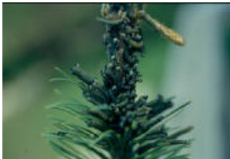
Figure 1 Large larvae

Previously discussed (Kansas Insect Newsletter Issue #1) European pine sawfly are nearly full grown, and as such, are rapidly consuming entire needle clusters (Figure 1) giving landscape plantings, such as mugo pine, a ragged appearance (Figure 2). Sawfly larvae can be eliminated with insecticides containing the active ingredients acephate, bifenthrin, esfenvalerate, lambda-cyhalothrin and permethrin. People preferring to utilize "softer insecticides" should consider rotenone/pyrethrin, horticultural oils or insecticidal soaps.