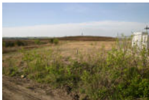
Figure 3 Web mass

Although previously unreported, eastern tent caterpillar web masses have recently been observed (Figure 3). Back tracking (in time) from their current size (Figure 4), initiation of their current season activities coincided with that for European pine sawfly — the last several days of March. Eastern tent caterpillars are also on the verge of completing their 2005 feeding phase.