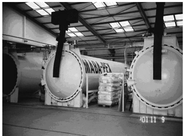
Figure 2. Application of high pressure CO 2 for the dry fruit industry in Turkey.

Flexible liners, loading and unloading equipment, nitrogen generators, or pressurized CO 2 (Figure 2) are commercially available. Equipment can be installed, maintained, and replenished with product on site.