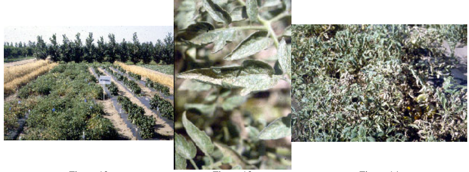
Figure 12 Figure 13 Figure 14

Spider mites are the cause of mid-summer woes for tomato growers. Often times, plants taking on a bronzed appearance (Figures 12). Upon closer inspection, stippling can be seen on individual leaves (Figure 13). Affected leaves eventually die and turn brown (Figure 14).