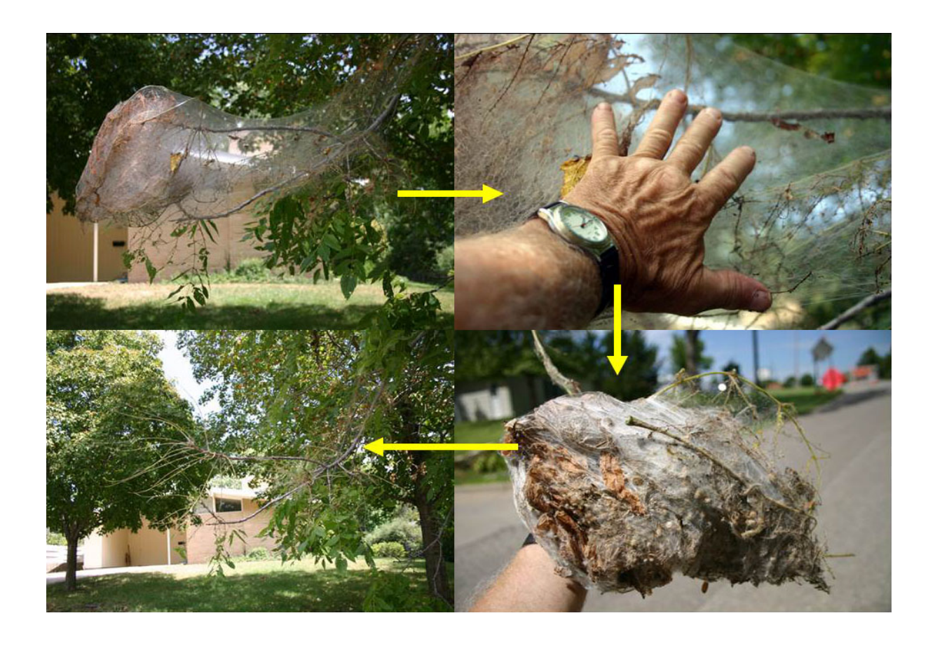
And, the "bare branch" still maintains auxiliary buds for the production of new foliage the ensuing Spring.