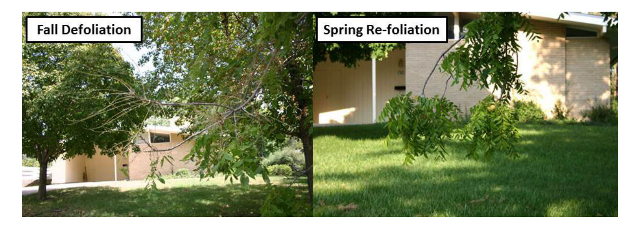
Additional on-line information is available in <u>Extension Publication MF2395</u>, <u>Web-Producing Caterpillars in Kansas</u>.