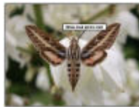
White-lined sphinx moth

Eventually a white-lined sphinx moth emerges to begin the second and final generation of the year