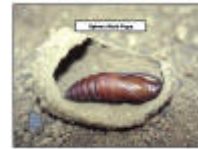
Sphinx Moth Pupa

Eventually a white-lined sphinx moth emerges to begin the second and final generation of the year