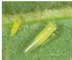
Adult Potato Leafhopper

Potato leafhoppers are lime green, torpedo or wedge-shaped insects with white eyes. They are very active insects and the adults will quickly hop or fly short distances when disturbed. Nymphs are similar in color and shape but lack wings.