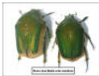
Green June Beetle color variations

Green June beetles are perfectly harmless. They neither bite nor sting. In fact, if a person takes the time to capture and examine a green June beetle, they will be amazed at the beauty of this beetle. The beetles wing covers possess a mostly velvety green appearance. Their undersides (“bellies”) have a green to bronze metallic sheen.