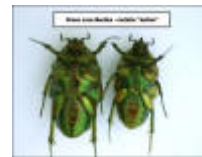
Green June Beetles - metallic "bellies"