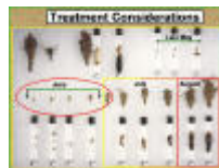
Stages of Bagworms

The last week of June and first week of July is an optimal time to apply sprays for bagworm control. All bagworm eggs will have hatched. At this time, bags will range in size from \frac{1}{4} to \frac{1}{2} -inch (or slightly more) in length (encircled in Red). Even the largest of current the bagworms are still relatively small and, therefore, incapable of causing noticeable feeding damage. Also, small larvae are quite susceptible to insecticidal treatments.