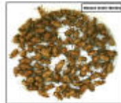
Masked Chafer Beetles

Last week’s hot daytime and warm evening temperatures are responsible for the current escalation of masked chafer activity. Most likely their flights will peak around the (traditional rule-of-thumb) July 4 holiday.