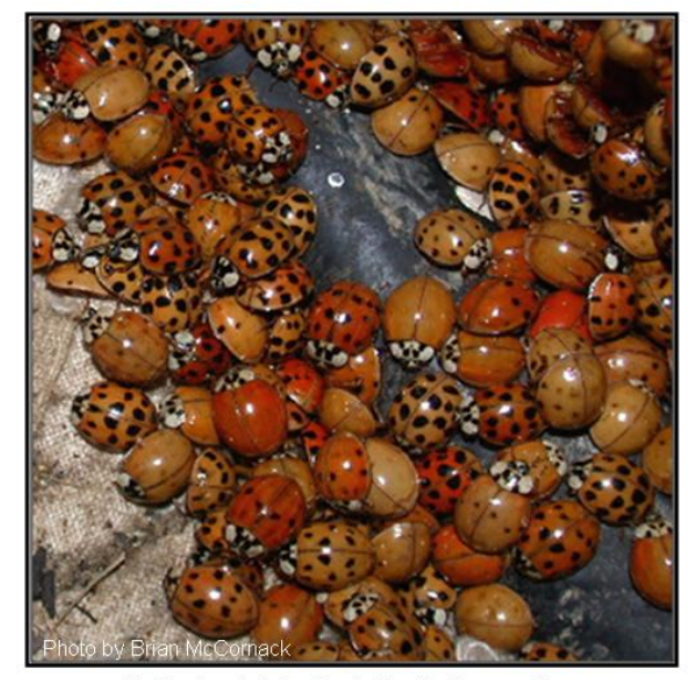
Multicolored Asian Lady Beetle Aggregation