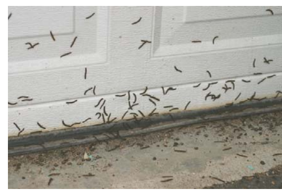
Figure 4 Figure 5