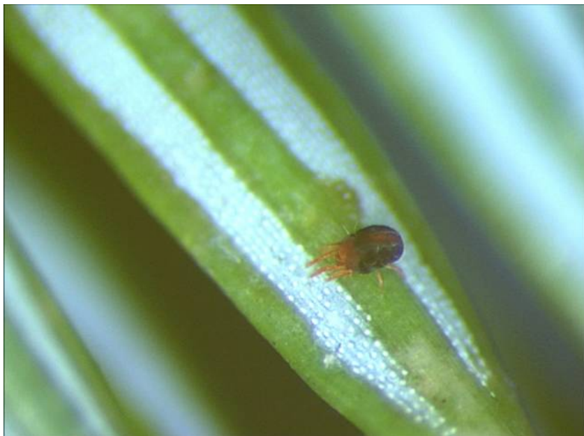
Fig. 1. Spruce spider mite.