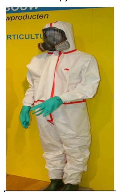
Figure 3: Tyvek Suit To Avoid Bites From Oak Leaf Itch Mite.