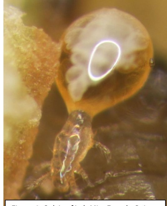
Figure 2: Oak Leaf Itch Mite Female Ovisac

For more information regarding oak leaf itch mites contact the Department of Entomology at Kansas State University (Manhattan, KS).