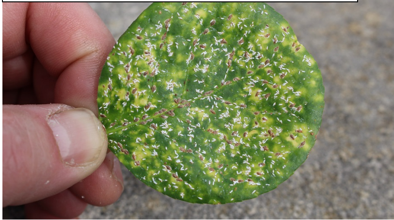
Figure 3. Female and Male Euonymus Scale on Leaf (Author-Raymond Cloyd, Kansas State University)

Males are typically located on leaves along leaf veins and females reside on the stems. There may be up to three generations per year in Kansas.