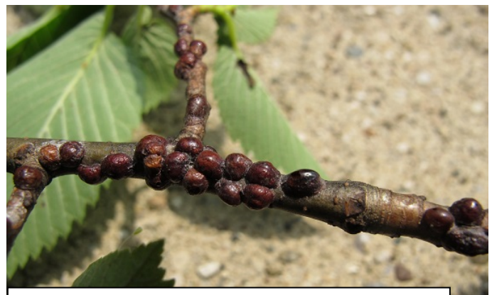
Figure 2. European Fruit Lecanium Scale on Branch (Author-Dan Potter, University of Kentucky).

European fruit lecanium scales are dark brown and 1/8 to 1/4 inches in diameter when mature (Figures 1 and 2). Some scales may have white or dark markings on the body. European fruit lecanium scale overwinters as an immature on twigs and branches with maturation occurring in spring. Females lay eggs underneath her body from May