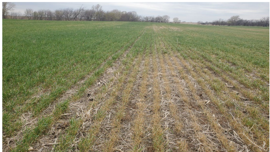
Figure 1 Mite damage on the Dickinson Co. line

Wheat (and alfalfa) continue to develop slowly throughout north central Kansas. Wheat mites, mostly winter grain and brown wheat mites, are still active throughout the central part of the state, but both species are slowly transitioning into their summer, non-feeding, stage (i.e., mite count in several fields averaged 50-60 winter grain mites per plant on 10 April, but only 7-10 per plant on 20 April). They have been feeding and thus competing with the plants for the little moisture that is present, thus we are often seeing the kind of feeding damage as in figure 1. Hopefully, adequate moisture plus the transition to the mite's non-feeding stage will help these areas recover.