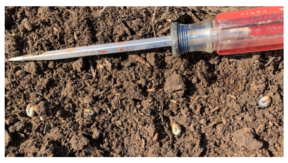
Figure 3 Japanese beetle larvae, 2022, from field in Fig. 2.