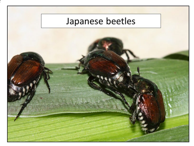
Figure 1 Adult Japanese beetles

east to west, and there have been reports of small but dense populations of Japanese beetles extending west past Interstate I-35 (see fig 2-soybean plants defoliated by adult Japanese beetles in Republic Co. in 2021-photo by J. Hammer). Japanese beetle larvae, commonly called white grubs, can now be found in some no-till areas of fields that were infested with the adults in 2021 (see fig 3 by J. Hammer). This is becoming more common because the adults feed for a short time then fly to nearby undisturbed areas to oviposit. Depending upon when these adults emerge they may feed on young corn leaves, silks, and/or young soybean leaves, as far as agricultural crops are concerned.