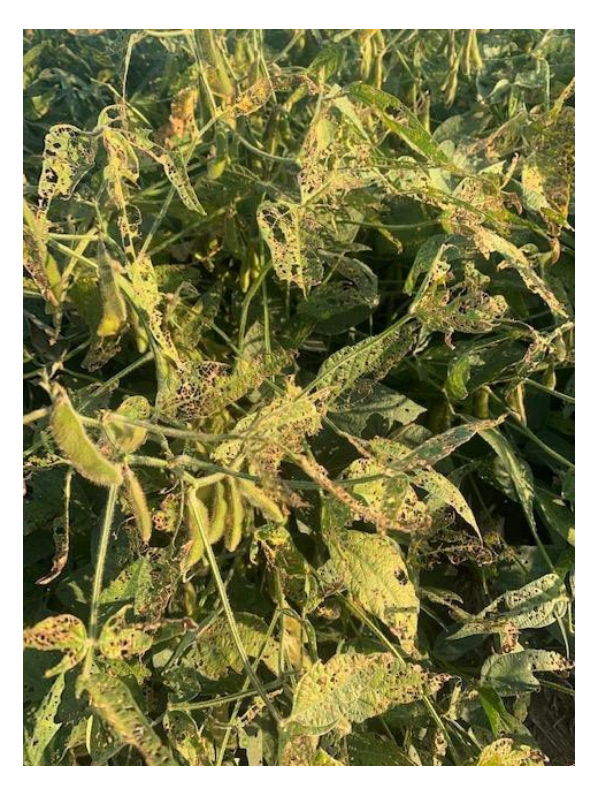
Figure 2 Soybean defoliation by Japanese Beetles in 2021, Republic Co., KS